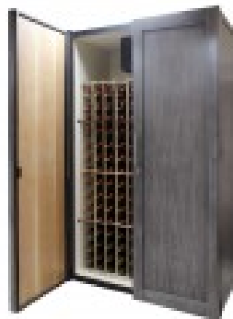
Vinotemp Wine Vault featuring Wine-Mate 1500CD and handcrafted wine racking for long-term storage of up to 368 bottles of wine.