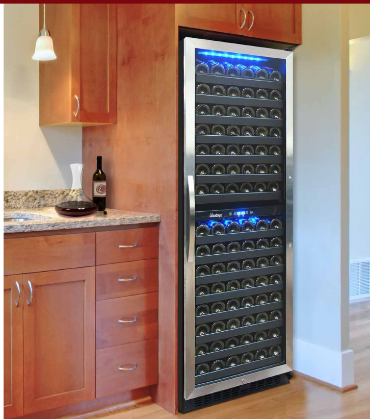
Centrally located control panel