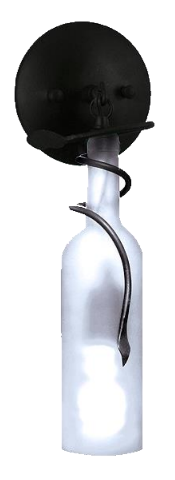
Storage, Accessories and More for the Discerning Epicureanist