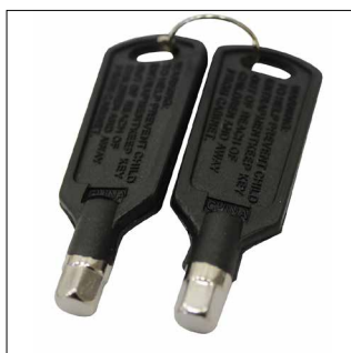
Key and Lock