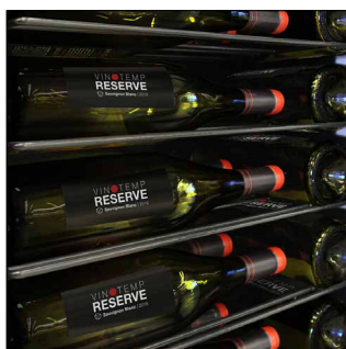
Bottles and Shelves