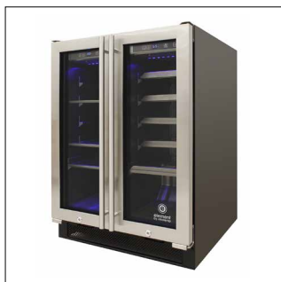
Unit without Bottles