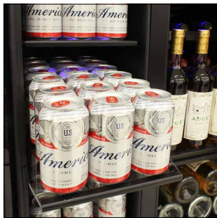
Cans in Left Zone