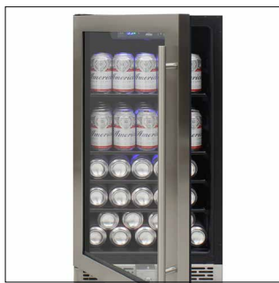
Opened Front View