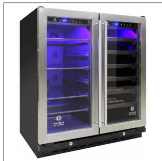
Unit without Bottles