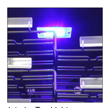
Interior Top Light