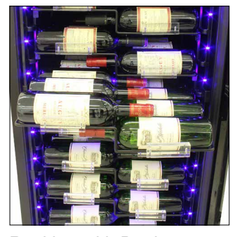
Racking with Bottles