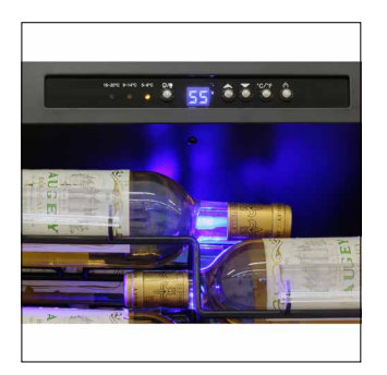
Control Panel and Interior