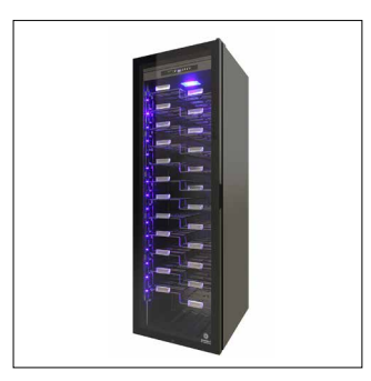
Unit without Bottles