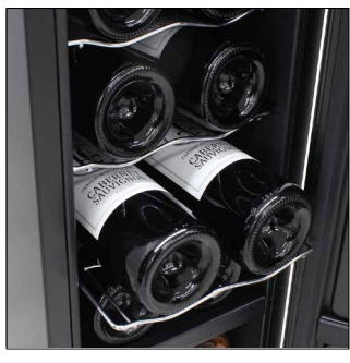
Shelves with Bottles