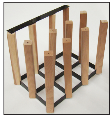
Step 5: Place vertical strips on dowels.