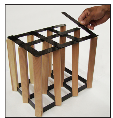
Step 6: Place horizontal strips over vertical strips.