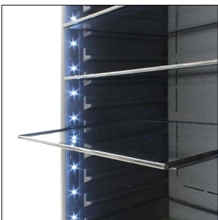
Adjustable Glass Shelves

Brama 300-Series Pantry Refrigerator (BR-300GREF) features sleek black cabinet body and door with a pole handle that make this unit a great addition to any pantry or garage setting. Beautiful enough to place inside the home, we designed this refrigerator with added insulation to be able to be used out of sight. With special insulation in both the cabinet and the door, it can withstand the higher temperature changes in warmer or colder climates. With a single temperature zone, this unit is perfect for storing food, groceries, and beverages at the right temperature.